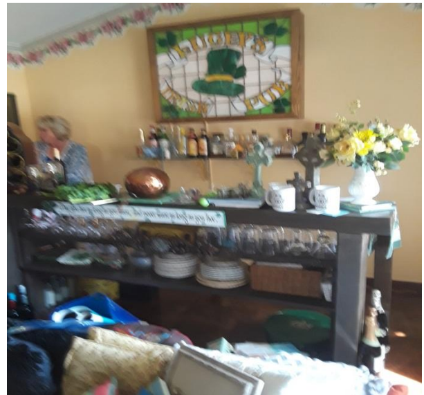
Lucey's Irish Pub at Muriel's