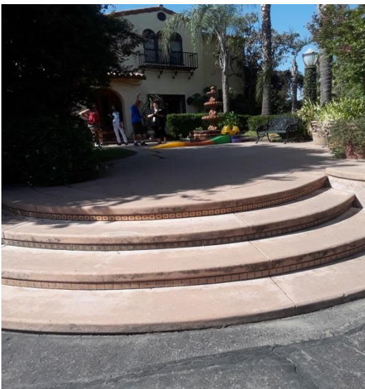
Exterior of Cline home