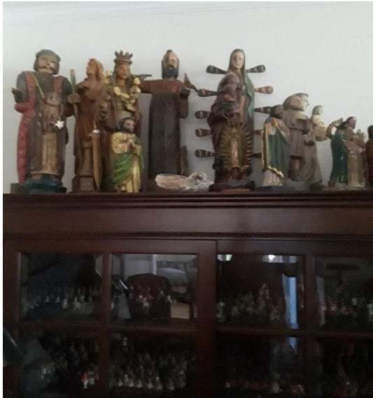
Shannon Icon Collection